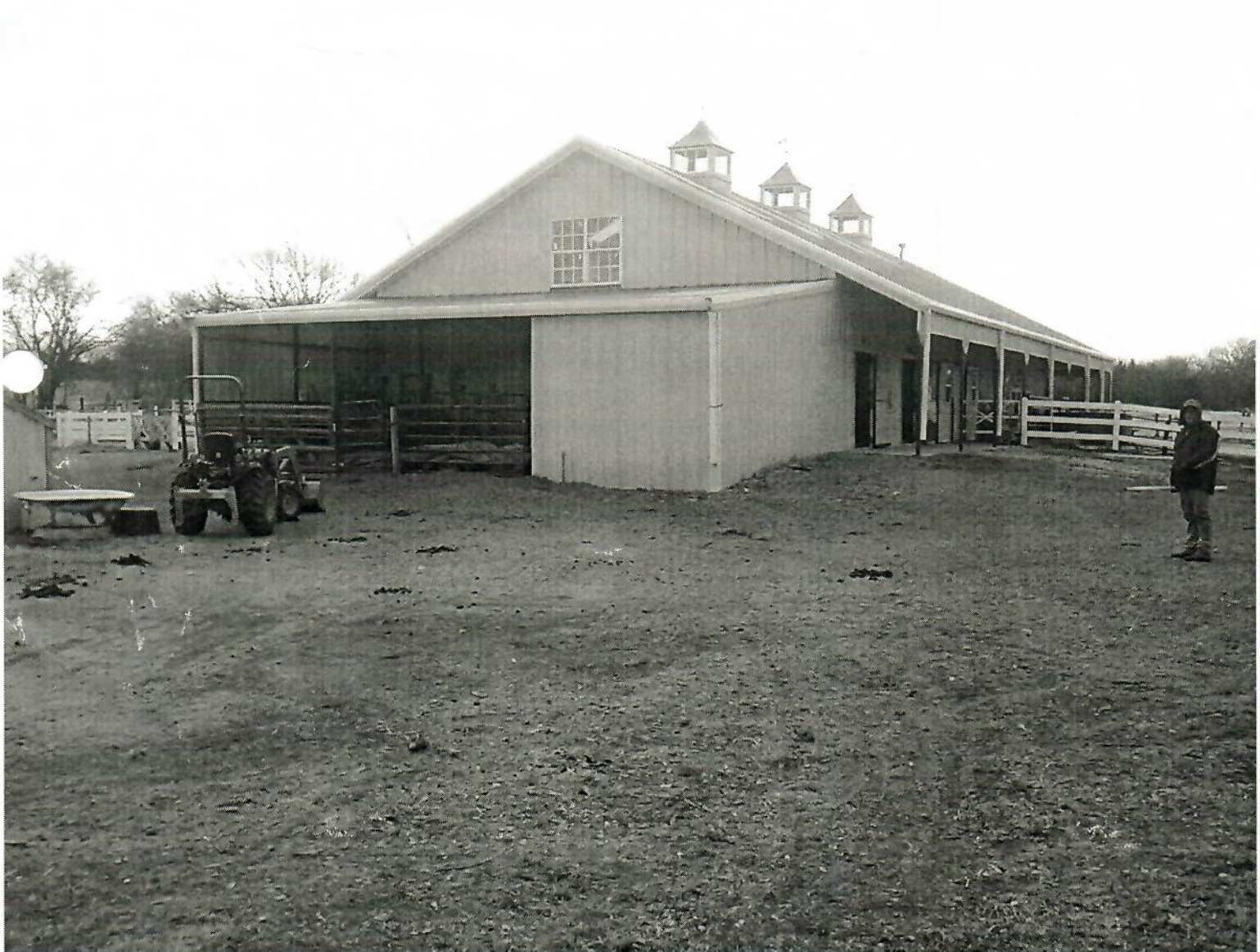
Rear of the Building (Jan. 18, 2011)