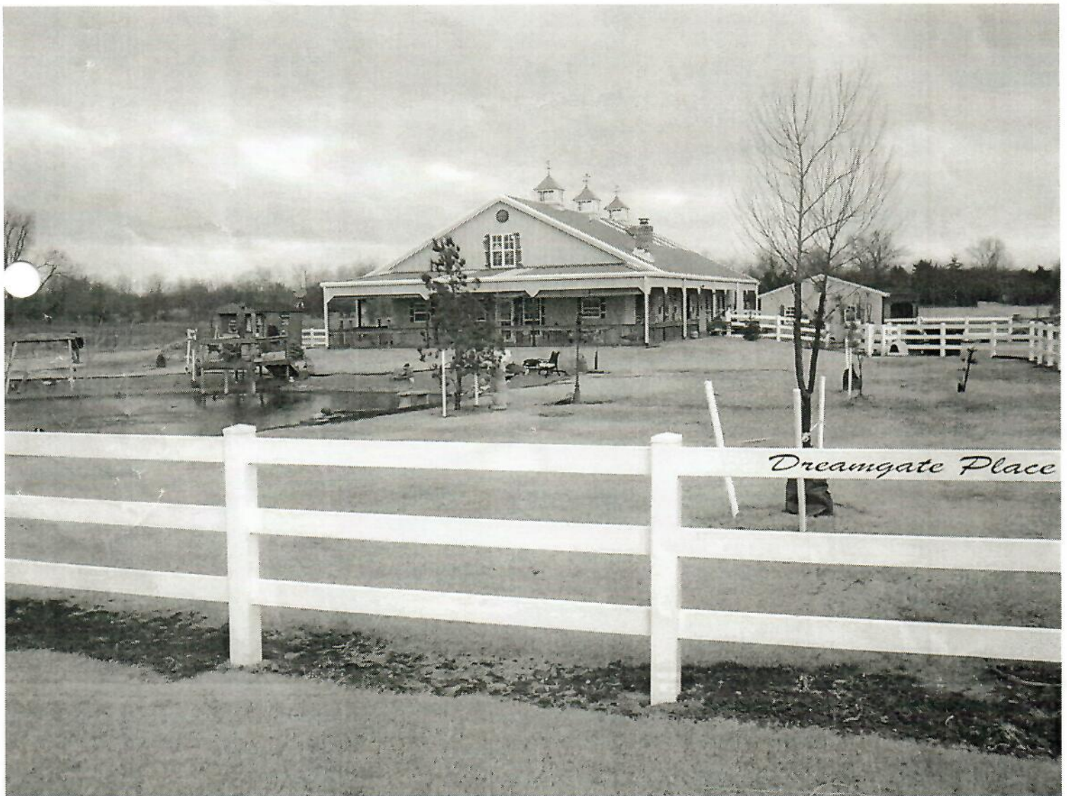
Front of Building (Jan. 18, 2011)