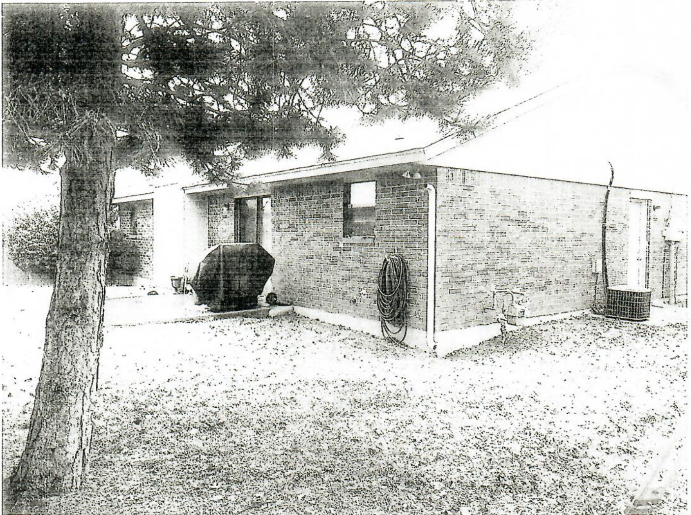
Rear View Looking Southwesterly

If submitting more photographs than will fit on the preceding page, affix the additional photographs below. Identify all photographs with: date taken; "Front View" and "Rear View"; and, if required, "Right Side View" and "Left Side View." When applicable, photographs must show the foundation with representative examples of the flood openings or vents, as indicated in Section A8.