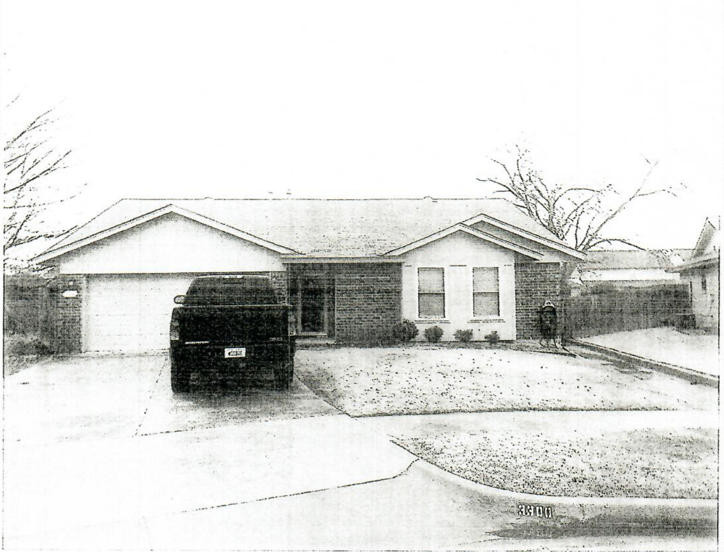
Front View looking East

If using the Elevation Certificate to obtain NFIP flood insurance, affix at least 2 building photographs below according to the instructions for Item A6. Identify all photographs with date taken; "Front View" and "Rear View"; and, if required, "Right Side View" and "Left Side View." When applicable, photographs must show the foundation with representative examples of the flood openings or vents, as indicated in Section A8. If submitting more photographs than will fit on this page, use the Continuation Page.