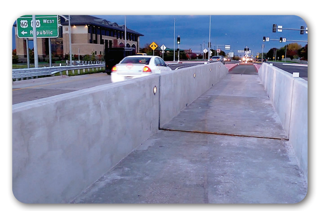
Center Pedestrian Refuge, Springfield, MO DDI

Given the importance of freight movement through interchanges, a DDI also is designed to accommodate large commercial vehicles. The