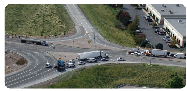
Trucks Using a DDI in Salt Lake County, UT

ability of trucks to turn on to and off of the ramps and navigate along the crossroad is not inhibited with a DDI. In surveys of commercial drivers using the Springfield (Missouri) DDI, 83 percent of respondents felt that maneuvering a large truck through the interchange was easy and no different from other interchange types.<sup>5</sup>