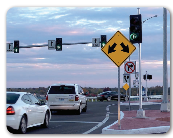
Springfield, MO DDI

Opened in 2009, the DDI in Springfield (Missouri) was the first in the United States. Since then, dozens more have been built in several states, and they have quickly become a popular interchange design option. Where they have been built, travelers save time, agencies saved money, and communities will benefit from safer facilities for many years.