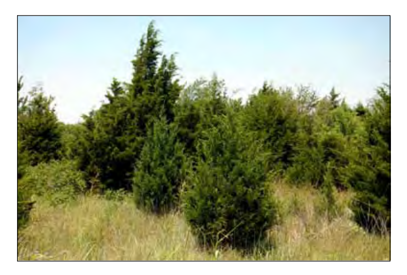
The spread of cedars reduces land productivity and value

The dense foliage of the trees also traps snow and rainfall that often evaporates and never gets into the soil to recharge groundwater.