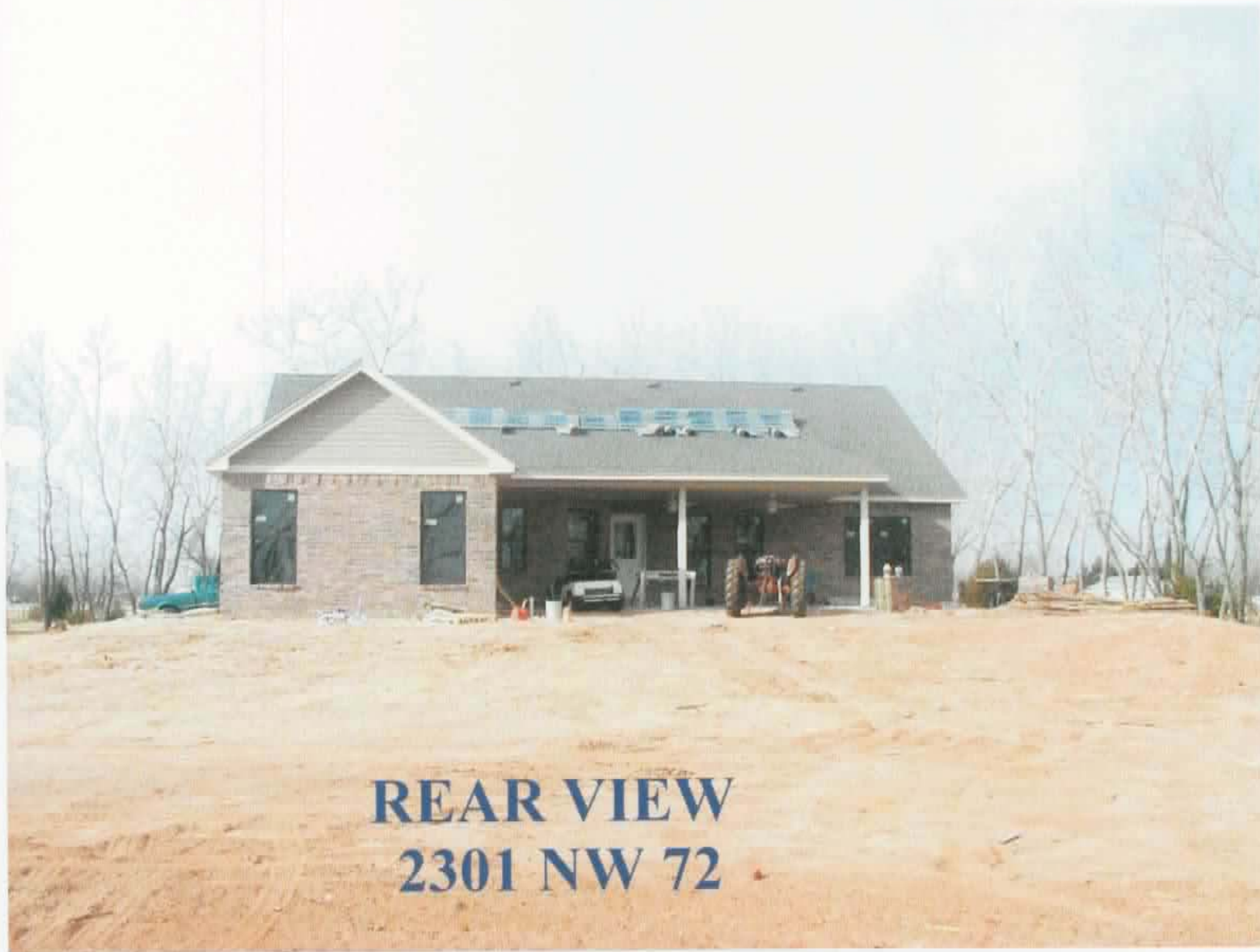
REAR VIEW 2301 NW 72