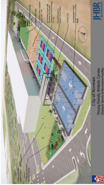
City of Norman Young Family Athletic Center Outdoor Sports & Recreation Facility