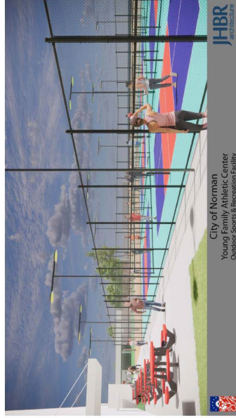
City of Norman Young Family Athletic Center Outdoor Sports & Recreation Facility