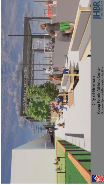
City of Norman Young Family Athletic Center Outdoor Sports & Recreation Facility