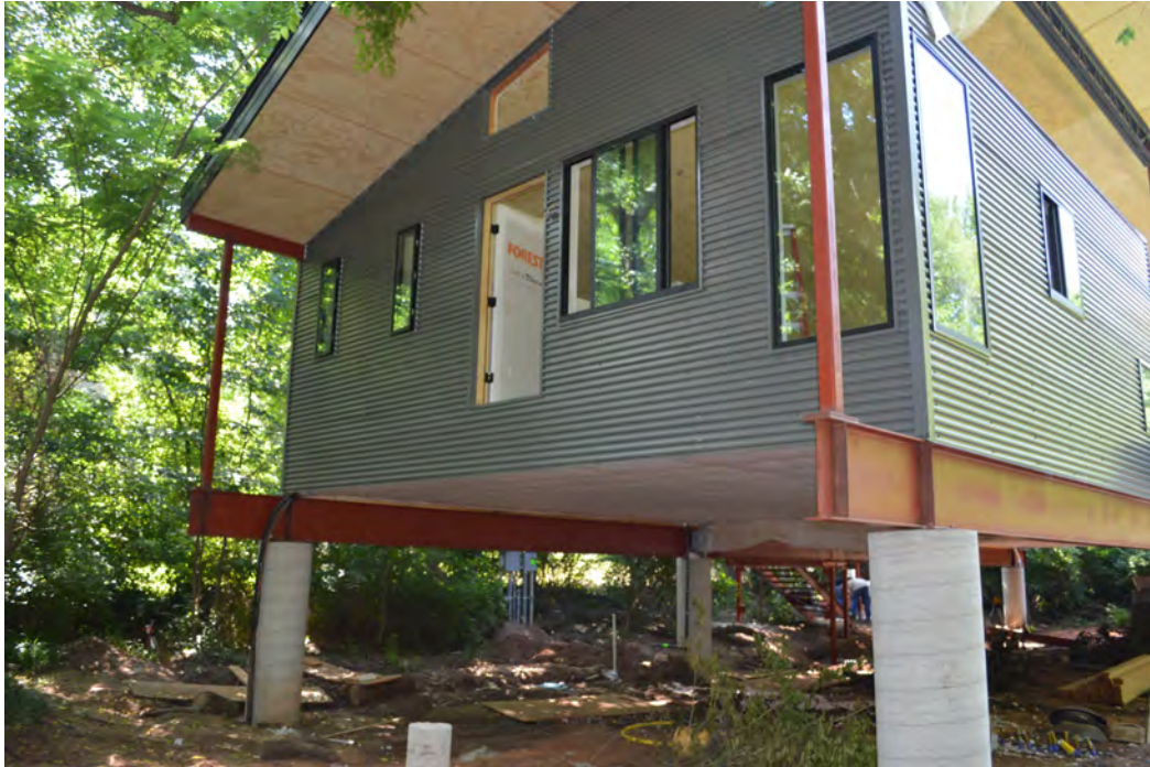
Left View (North) 7/10/2018

If submitting more photographs than will fit on the preceding page, affix the additional photographs below. Identify all photographs with: date taken; "Front View" and "Rear View" and, if required, "Right Side View" and "Left Side View." When applicable, photographs must show the foundation with representative examples of the flood openings or vents, as indicated in Section A8.