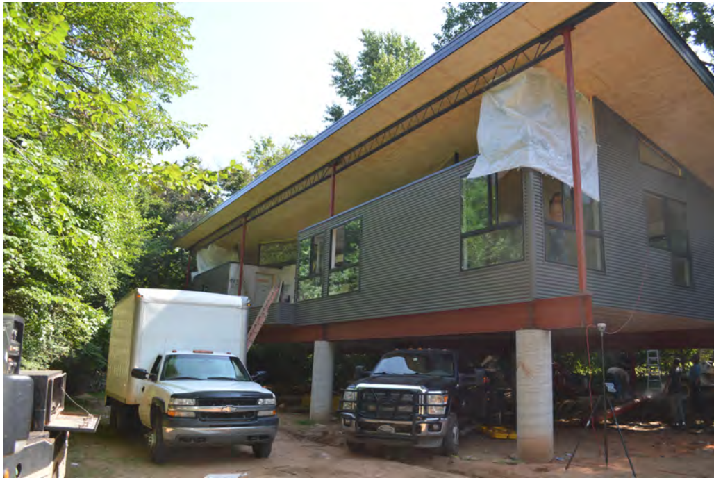
Front View (West) 7/10/2018

If using the Elevation Certificate to obtain NFIP flood insurance, affix at least 2 building photographs below according to the instructions for Item A6. Identify all photographs with date taken; "Front view" and "Rear view"; and, if required, "Right Side View" and "Left Side View." When applicable, photographs must show the foundation with representative examples of the flood openings or vents, as indicated in Section A8. If submitting more photographs than will fit on this page, use the Continuation Page.