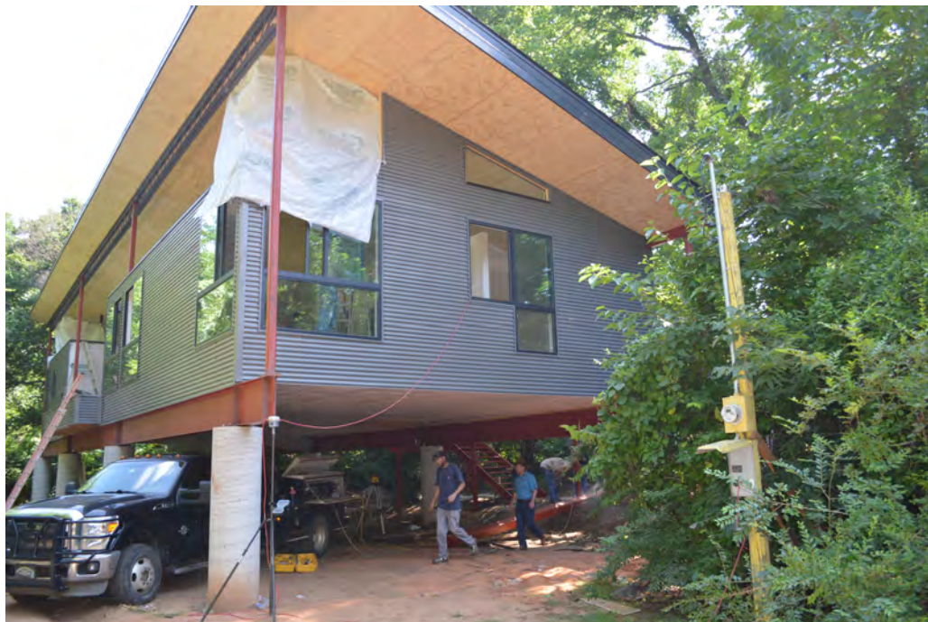
Right View (South) 7/10/2018