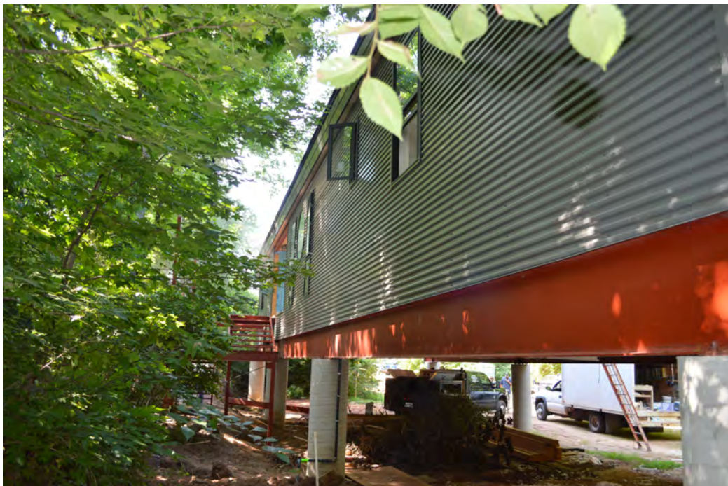
Rear View (East) 7/10/2018